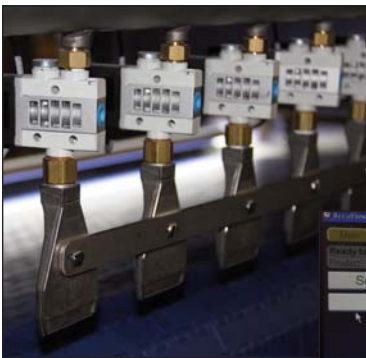
Computer controlled stainless steel air jets remove defects to reject takeaway conveyor.

Easy to read screen tells operator in an instant % good, % marginal and % rejected by lane.