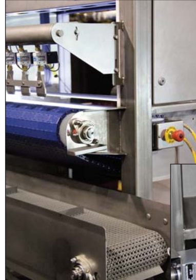
Reject takeaway conveyor.