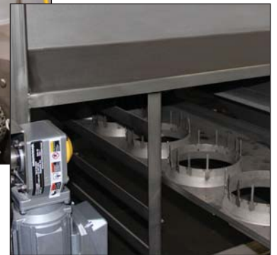
Convenient storage of counter stacker change over parts.